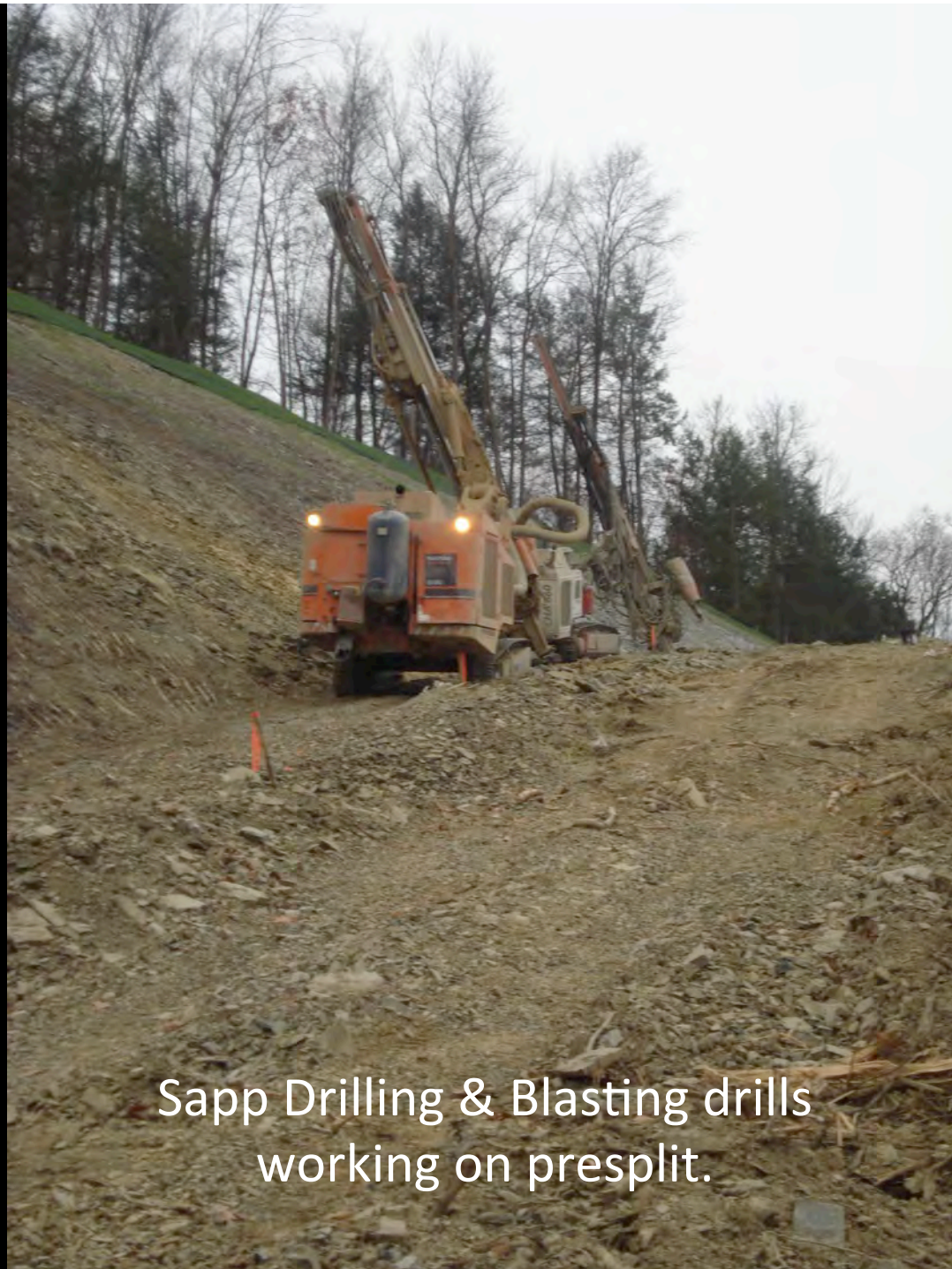
Sapp Drilling & Blasting drills working on presplit.